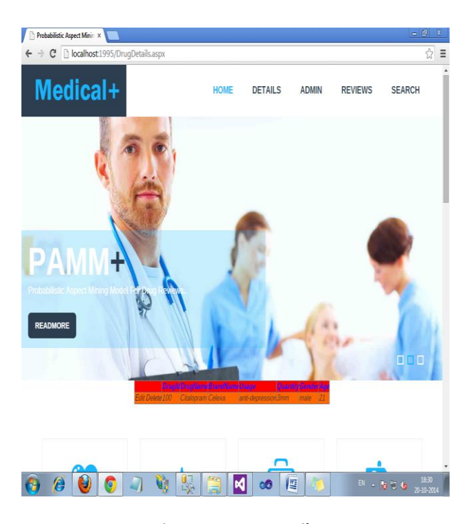
Figure: 2 Drug Details

The figure 2 shows Drug Details. The admin have to store the drug, brand name and quantity details in database.