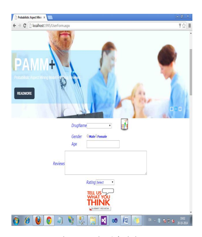
Figure: 4 Review Submission

The figure4 shows Review Submission. In Review Submission, the user gives drug name, gender, age, reviews and rating for the product.