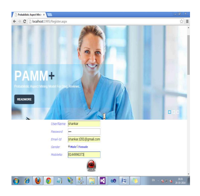
Figure: 3 User Registration

The figure3 shows user registration. In user registration, users have to register his\her name, password, Email-id, Gender and mobile number.